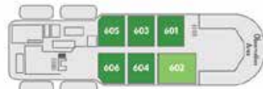
SHACKLETON DECK Owner's & Hebridean Suites